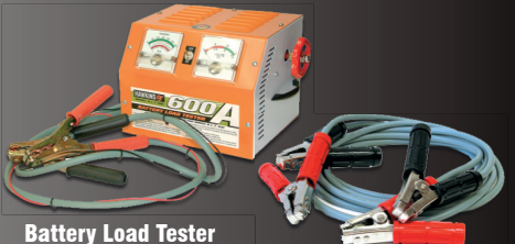
Battery Load Tester