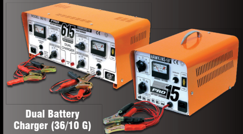
Dual Battery Charger (36/10 G)